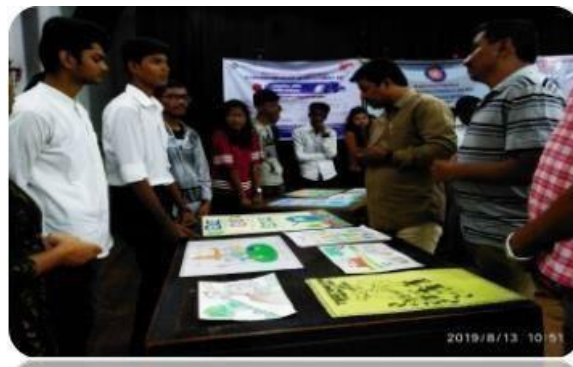
Rally on "Swachh Bharat Abhiyan" on 14th Aug. 2019