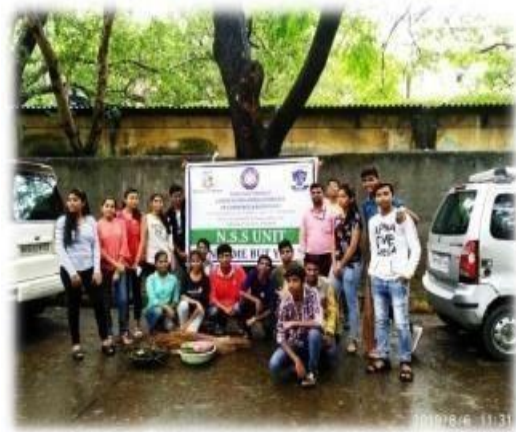
Cleanliness Drive in NSS adopted area Ghatkopar Railway Station and Near Rajawadi Hospital Area on 6th and 8th Aug.2019